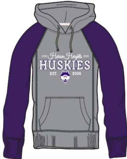
Men's Hoodie - $55