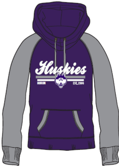
Women's Hoodie - $55

Clothing items will be on sale from Wednesday, September 13 th until Thursday, September 21 st . Items will be available in the front lobby to try on for sizing. Since these items are made-to-order, there will be no refunds, returns, or exchanges. Payment is due immediately upon order in cash or cheque payable to Huron Heights. No orders can be placed without full payment. Items will be shipped to the school in approximately 3-4 weeks and will be distributed by the Leadership Class.