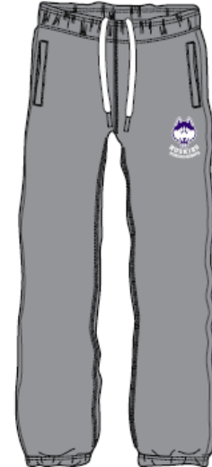
Grey Track Pants - $40